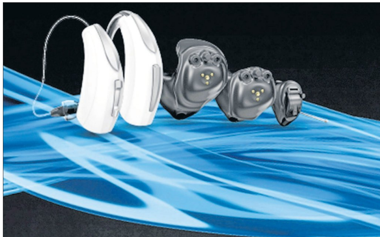
GET HELP: So many people experience hearing loss. Seek help from professionals.

When focusing on the ease of wearing, there are three aspects to consider which